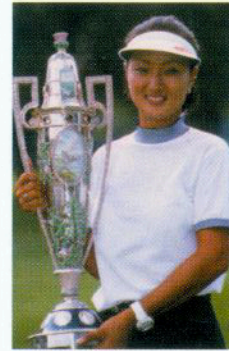
1998: Grace Park Barton Hills C.C. Ann Arbor, Mich.